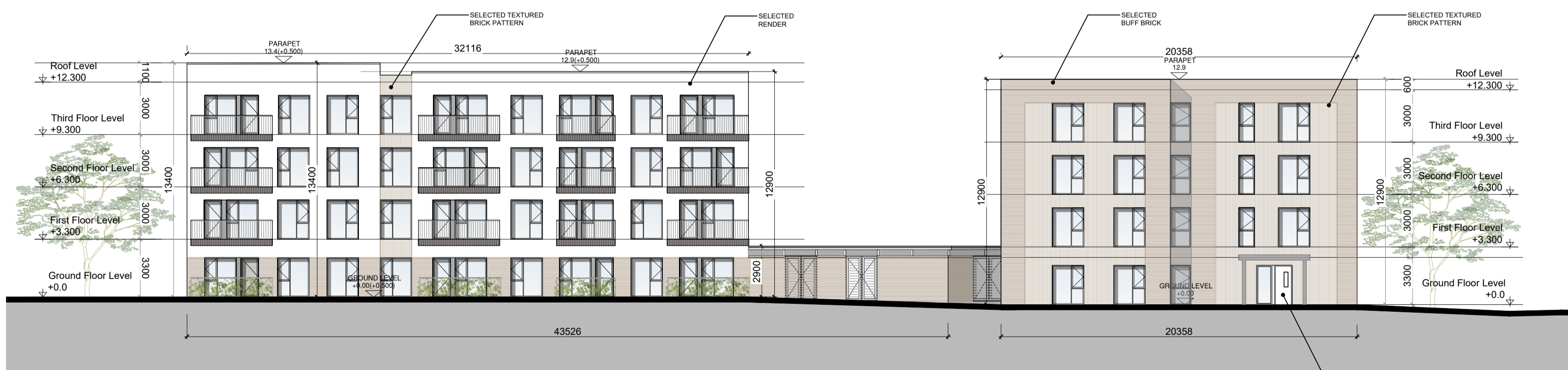
04 SOUTH ELEVATION SCALE 1:200 @ A1